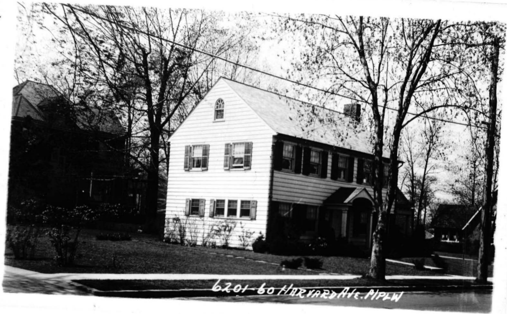
6201-60 HARVARD AVE. MPLW